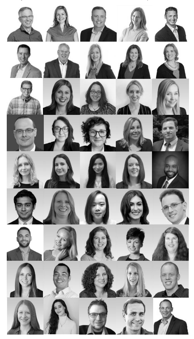
Meet just a few of our financial service research experts:

Our financial service research experts understand your needs and are at the forefront of what is (and is not) impacting your research and your business. Let's continue our strategic partnership to keep research moving forward in a time when the financial services sector needs it more than ever.